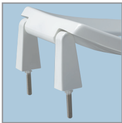
3" LIFT HINGES AND BUMPERS