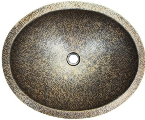
Shown in AB