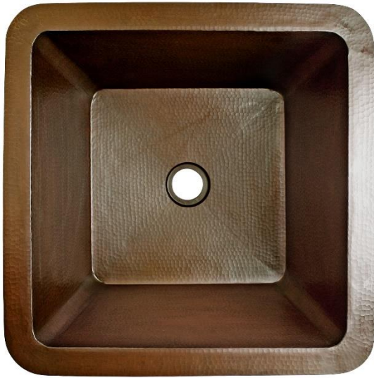
Shown in DB